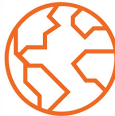
Civic and Global Responsibility