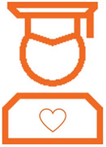
Ethics, Integrity, and Commitment to Diversity and Inclusion

This map is designed for you to capture courses, experiences, and campus jobs that will help you develop the knowledge and skills employers and graduate schools seek. Sketch out a path with all six competencies in mind and review it with your advisor!