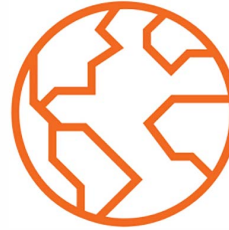
Civic and Global Responsibility