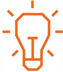
Critical and Creative Thinking