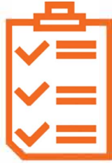
Scientific Inquiry and Research Skills